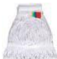
Cotton Wet Mop Refill, Bleached Loop End with Colour Coded Strip