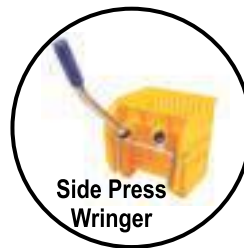
Side Press Wringer

Usage - Industrial Frame - Plastic Bucket Capacity - 25 ltr. Wringer Type - Side Press