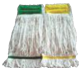
Loop End With Color Patti