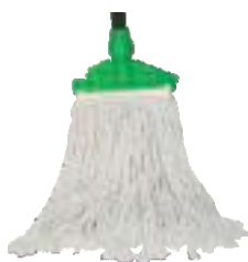
Bleached Cotton Wet Mop Refill-Cut end