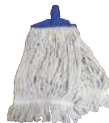
Cotton Wet Mop Refill, Natural, Loop End.