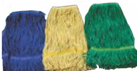
Colour Cotton Wet Mop Refill- Loop End.