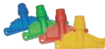
Wet Mop Clip