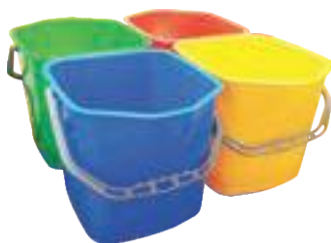
20 Ltr. Bucket

Usage - Industrial Bucket Capacity - 20 ltr. Wringer Type - Side Press Frame - Metal