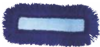
Micro Fibre Dry Mop Refill

Usage - Domestic & Industrial Available in Size - 40 cm, 60 cm & 80 cm