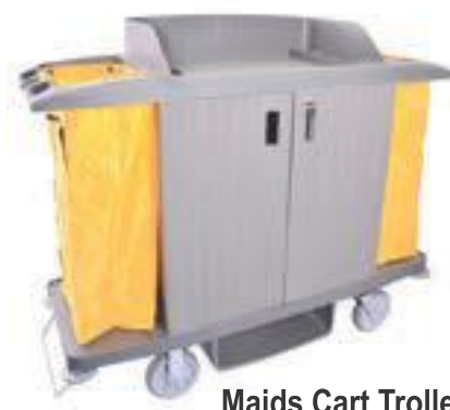
Maids Cart Trolley Dimension - Length 58 Inch. Width 22 Inch. Height 48 Inch.