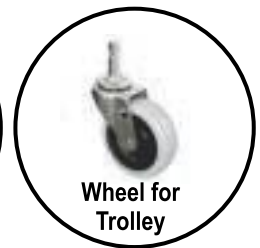
Wheel for Trolley