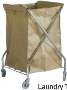
Laundry Trolley Heavy Stainless Steel Frame Foldable & Ergonomic Design

Mrinmoyee ™ Solutions for Cleaning & Hygiene