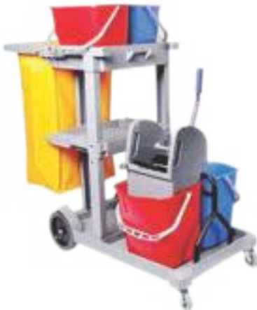
Multi Function Janitor Cart